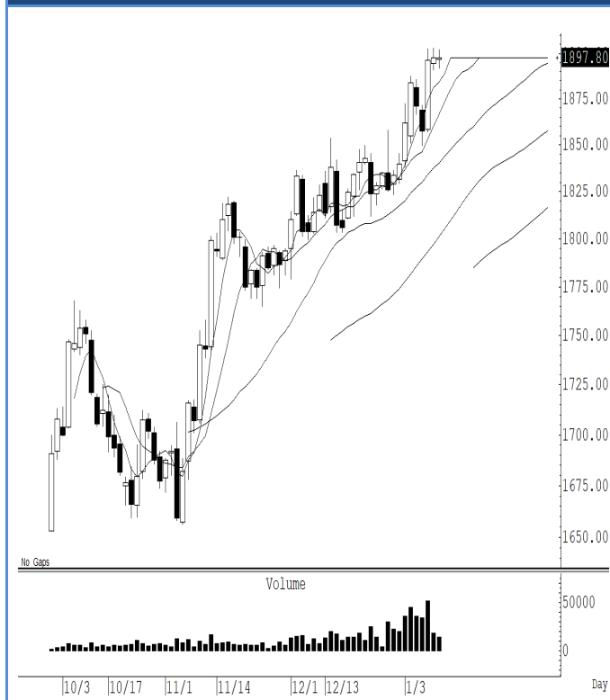
GOH23 (Close 1,897.80 Chg 0.0)

ราคาทองคำน่าจะมี upside อีกเล็กน้อยก่อนที่จะย่อตัว สั้น ๆ ไม่ต่ำกว่า แนวรับแถว ๆ 1,875 ดอลลาร์ แนะนำ trading ในกรอบ 1,875-1,920 ดอลลาร์ รับรู้กำไร แต่ถ้าในกรณีนี้ที่ปิดต่ำกว่าระดับ 1,870 ดอลลาร์ แนะนำ ถือ short หวังผลปรับตัวลงไปแถว ๆ 1,815 ดอลลาร์